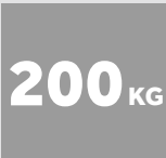
200 KG BALE WEIGHT CARDBOARD