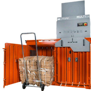
Multiple strap choice to meet both the demands of the material and tough handling requirements.

Whilst the baler compacts the material in one chamber, the other is open and ready to be fed with more material!