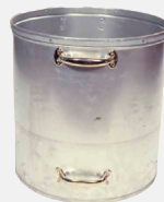
Optional steel container for safe handling of, for example, tins and glass after compaction.