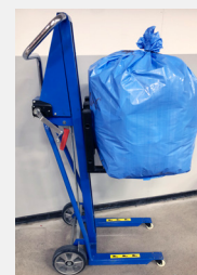
A simple-to-use option – the Orwak bale/bag lifter. Eliminates manual heavy lifting.