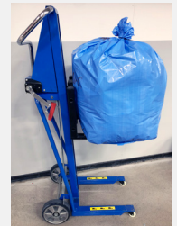
A simple-to-use option – the Orwak bale/bag lifter. Eliminates manual heavy lifting.