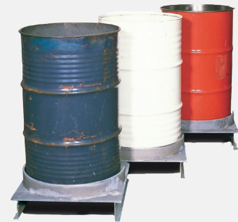
Standard drums can be used for storage and transport of the hazardous waste. Sorting is possible by using several drums.

It is easy to feed material into the open top-loading unit. The compactor is safe and simple to operate.