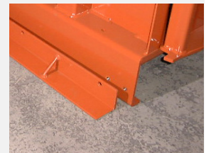
Skid mounting for bolting the machine to the floor