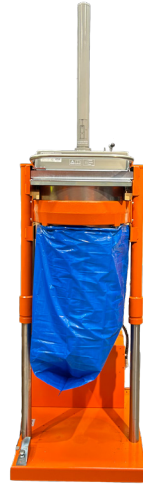
Emptying height, when the drum is hoisted, is 2660 mm with the standard B drum and only 2360 mm with the shorter C drum.

A compacted and well-sealed bag prevents leakage and odours. The machine is designed for easy daily cleaning and critical parts are made of stainless steel.