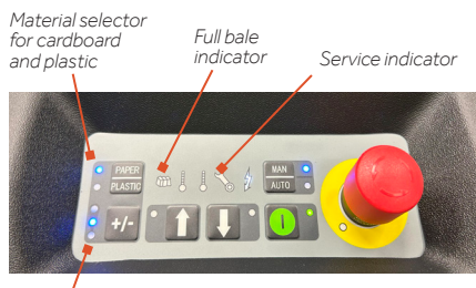
Adjustable bale size

Model 3115 is always delivered with a bale trolley for effortless baling and smooth internal transportation of the bale.