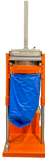
Emptying height 2660 mm is standard

It is easy to feed material into the the open top-loading unit. The compactor is safe and simple to maneuver and the built-in hoisting function makes the bag switch fast and convenient