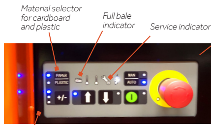
Adjustable bale size