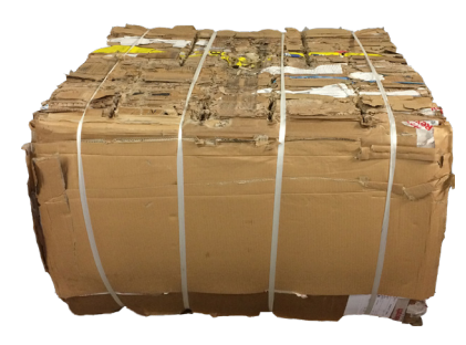
Dense mill size bale

"The latch and wheel" locking system on the lower door allows the operator to gradually open the door in a controlled way even when compacting expanding materials.