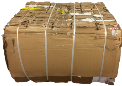
Dense mill size bale

"The latch and wheel" locking system on the lower door allows the operator to gradually open the door in a controlled way even when compacting expanding materials.