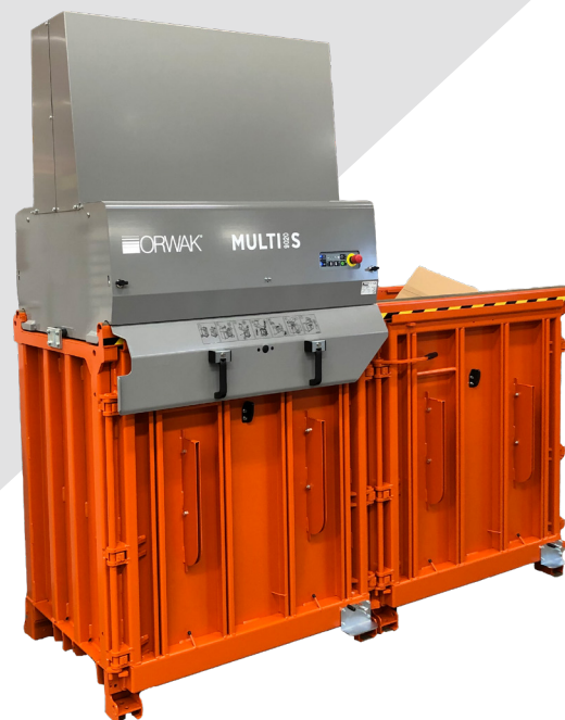
BALE WEIGHT CARDBOARD