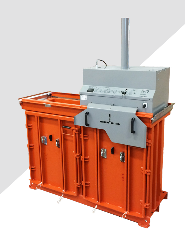
BALE WEIGHT CARDBOARD