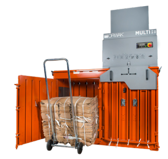
Multiple strap choice to meet both the demands of the material and tough handling requirements.

Whilst the baler compacts the material in one chamber, the other is open and ready to be fed with more material!