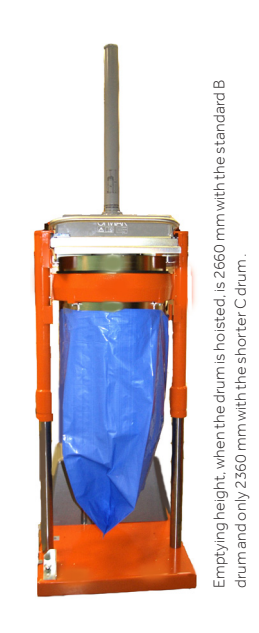
Wheeled – for easy cleaning and relocation. Compact size and small footprint. The New Classic comes with a fresh design and a durable finish

A compacted and well-sealed bag prevents leakage and odours. The machined is designed for easy daily cleaning and critical parts are made of stainless steel.