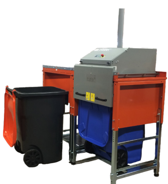
Designed to fit the standard 9\overline{6} gal bins in the market

Safety and quality are our hallmarks and the compactor provides maximum personal safety both for the operator and those in the immediate vicinity. A bin indicator assures that the machine can only start, when the bin is in the right position.