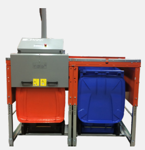
The multiple-chamber unit equipped with an apron with two handles