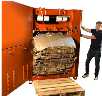
Simply push two buttons for bale ejection!