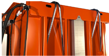
Pipes for easy bale strapping

The baler is fast and with a cycle time of just 16 sec, it is ready for a new load of cardboard boxes or plastic foil in no time and auto start is a standard feature! 3220 can be operated manually but is preferably run in auto mode for maximum productivity and convenience.