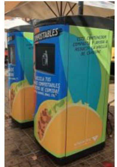
Compaction ratio 8 to 1