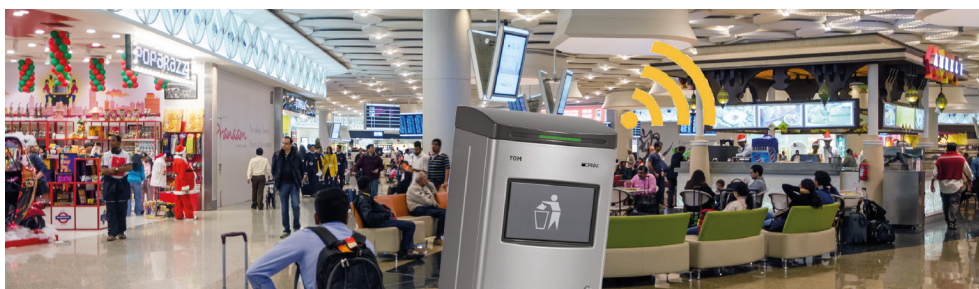
TOM CONNECT M2M communication service!