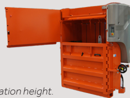
Regular door for extra low installation height.