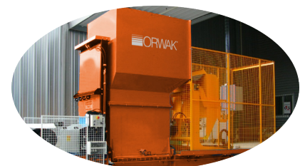
OPTION: BIN LIFTER

We reserve the right to make changes to specifications without prior notice. Bale weights are dependent upon material type.