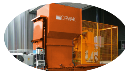
OPTION: BIN LIFTER

We reserve the right to make changes to specifications without prior notice. Bale weights are dependent upon material type.