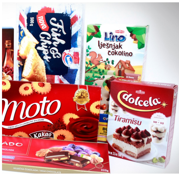
Food packaging print is one of Grafičar's core products.