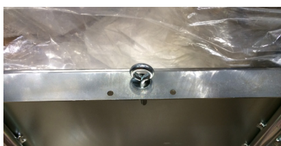
A pin keeps the bin attached to the trolley