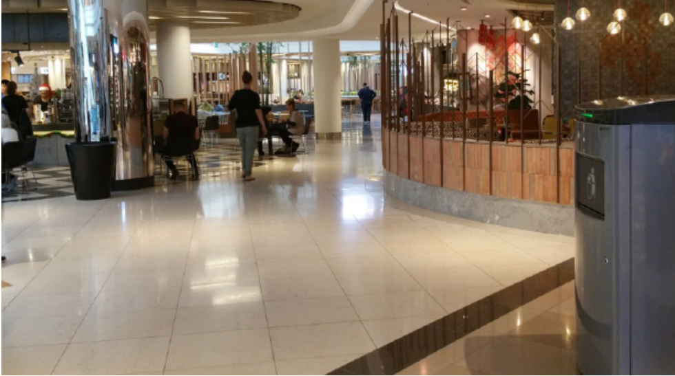
TOM sitting out the front of Nandos Chadstone VIC in Melbourne

Congratulations Vicinity Centres! First in Australia to install TOM - the smart compacting bin.