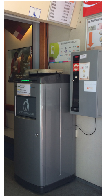
The decision to rent TOM, brings savings to the cafeteria Restoquick in Eindhoven.