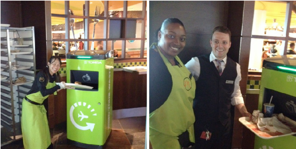
The staff enjoys working with TOM at HMSHost's food court.

After thorough testing, HMSHost chose TOM as an solution to efficiently reduce the waste streams from its operations in the terminals at Amsterdam Airport Schiphol.