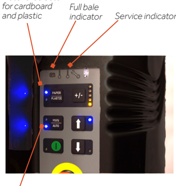
Adjustable bale size