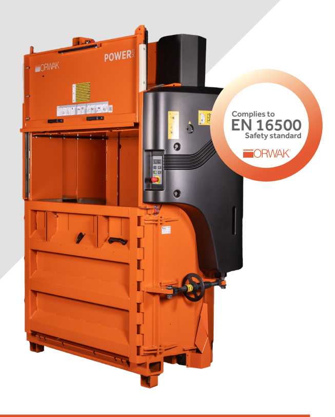
BALE WEIGHT CARDBOARD