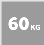
BALE WEIGHT CARDBOARD