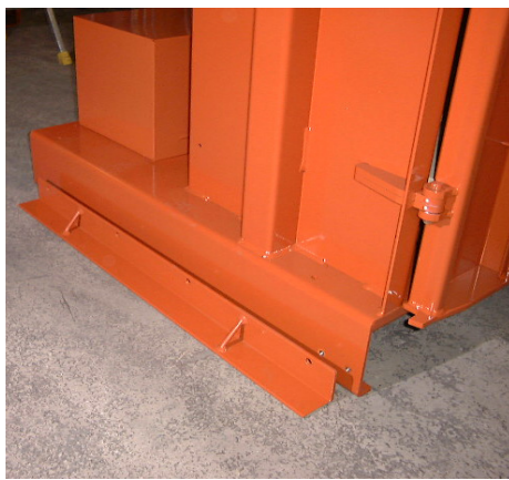
Skid mounting for bolting the machine to the floor