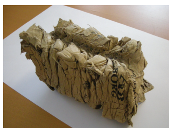
Small and compact briquette