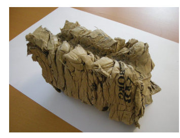
Small and compact briquette