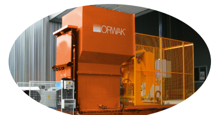
OPTION: BIN LIFTER

We reserve the right to make changes to specifications without prior notice. Bale weights are dependent upon material type.