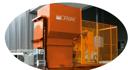
OPTION: BIN LIFTER

We reserve the right to make changes to specifications without prior notice. Bale weights are dependent upon material type.