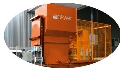
OPTION: BIN LIFTER

We reserve the right to make changes to specifications without prior notice. Bale weights are dependent upon material type.