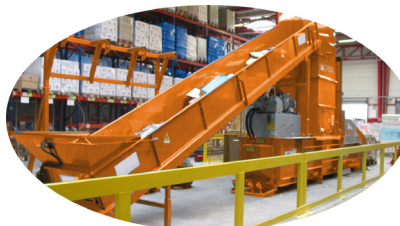
OPTION: CONVEYOR BELT