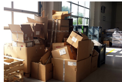
Before: empty cardboard boxes were piling up quickly