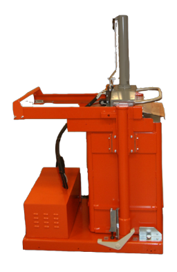
Mounted on wheels for easy manoeuvring when cleaning