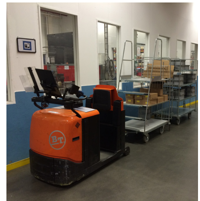
The small electric train supplies components and removes the bales.