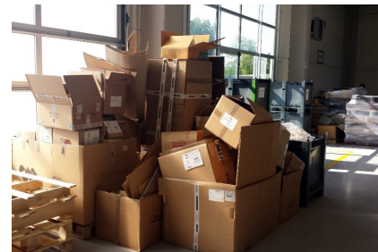
Before: empty cardboard boxes were piling up quickly