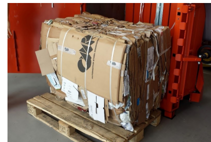
The new Orwak solution: efficient compaction and baling

"In short, we are very satisfied with the newly installed machines!"