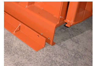
Skid mounting for bolting the machine to the floor