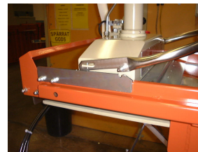
Lockable handle on the press unit

To fit into confined spaces aboard ships and offshore rigs, the 5030-BMT comes with a telescopic cylinder. The installation height is only 1640 mm and with hoisted drum the emptying height does not exceed 2040 mm. Lockable handle, skid mounting and halogen free cables are available options to meet extra high safety requirements in your environment.