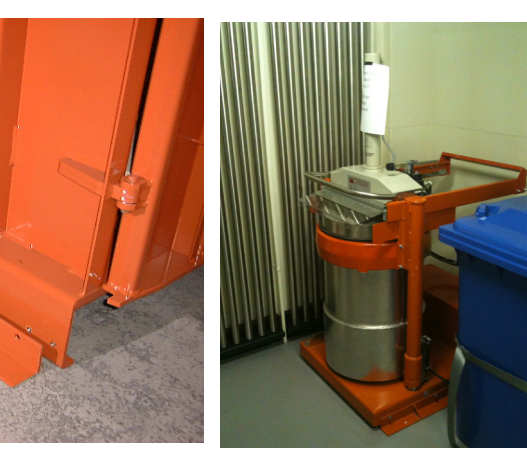
Lockable handle on the press unit